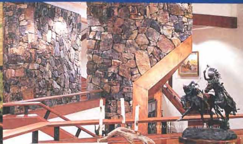
10 WINDS OF THE WEST